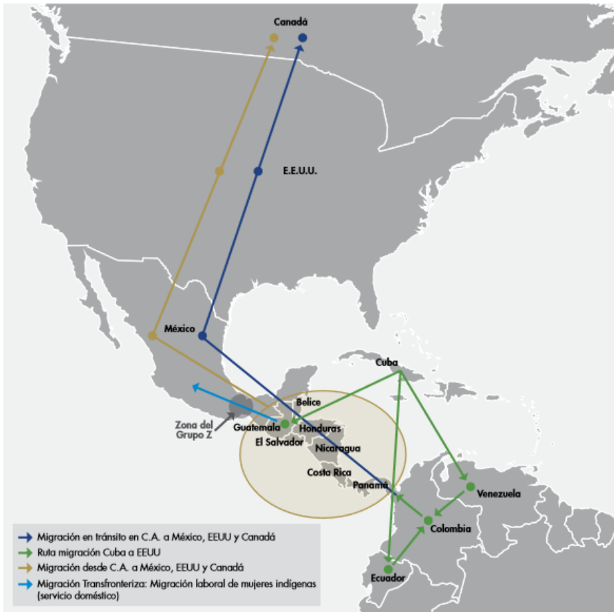
Stock de mujeres migrantes centroamericanas por país de origen y país de destino, 2015